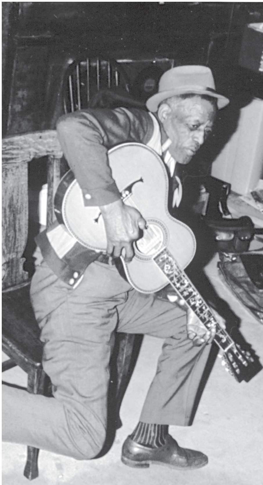
Son House imitating Charley Patton.